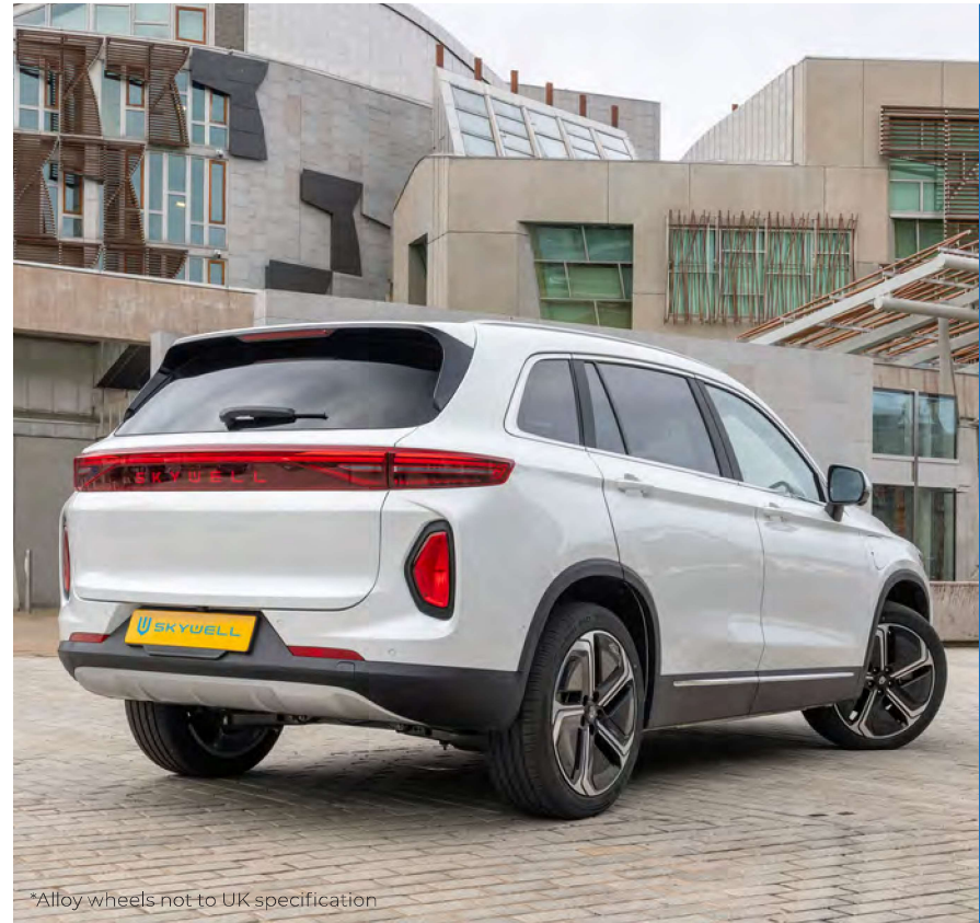
*Alloy wheels not to UK specification

The BEI1's athletic and refined silhouette is enhanced by the 'Lynx' 19" diamond-cut wheels and sleek roof rails, while the black skirting and window moulding add further protection for rough trail adventures.